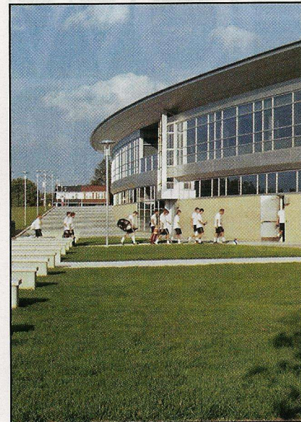
Exterior aluminum panels lend a sense of machine-like simplicity while subtly evoking the site's industrial past.