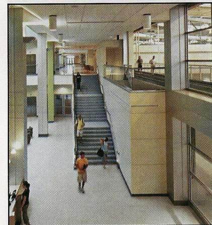
A long interior "Main Street" bisects the building, providing a logical continuation of the pedestrian path that connects two campuses.