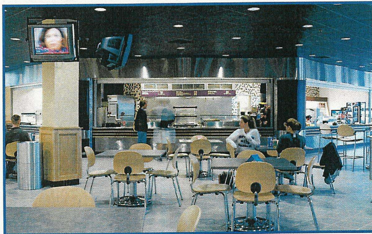
The Marlin Sports Grille features room for live music and both indoor and outdoor seating.

Architect of Record: Stanmar Inc. Sudbury, Mass.