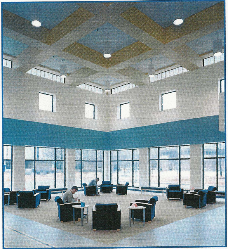
From the open and airy main lobby and lounge, visitors have expansive views out to the campus quad.