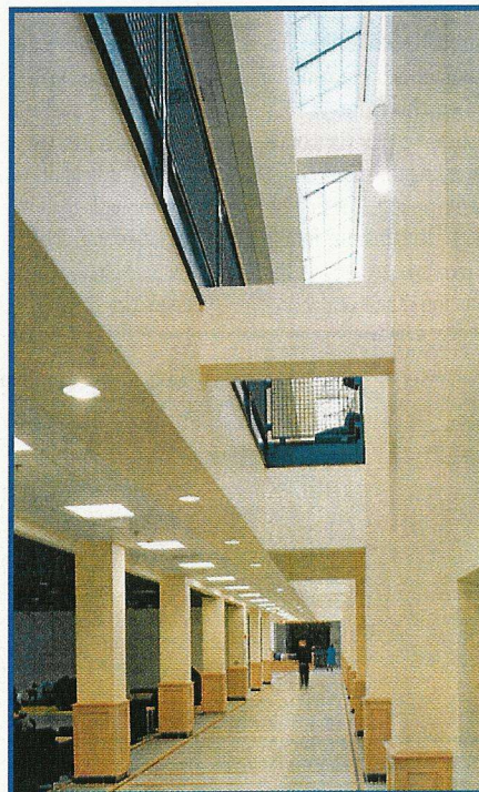
Activity spaces are linked by skylit "Main Street North" and "Main Street South" corridors.