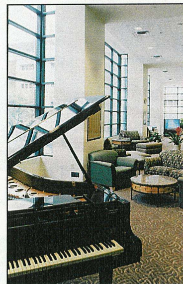
A COMFORTABLE AND INVITING RECREATION LOUNGE WITH A GRAND PIANO IS LOCATED OFF THE MAIN LOBBY.