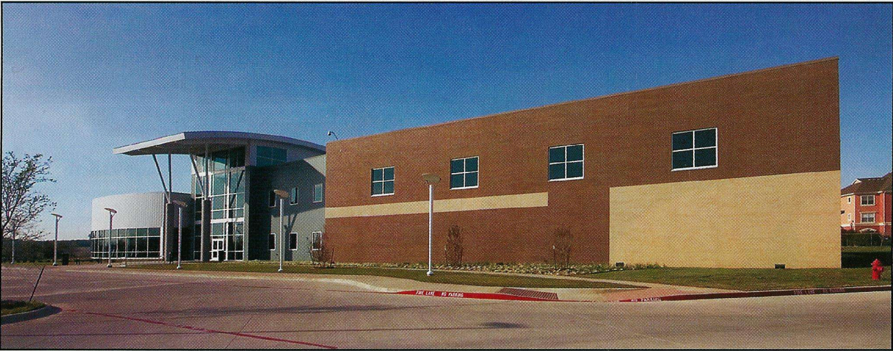
The Roanoke Recreation Center is a steel and concrete block structure with a combination of masonry veneer and metal panel exterior elements.