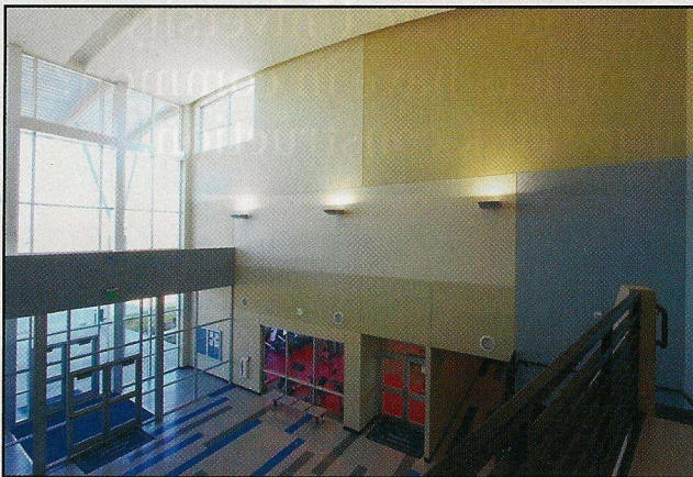
All activity areas are organized around a colorful, two-story glass atrium with a striking curved roof.