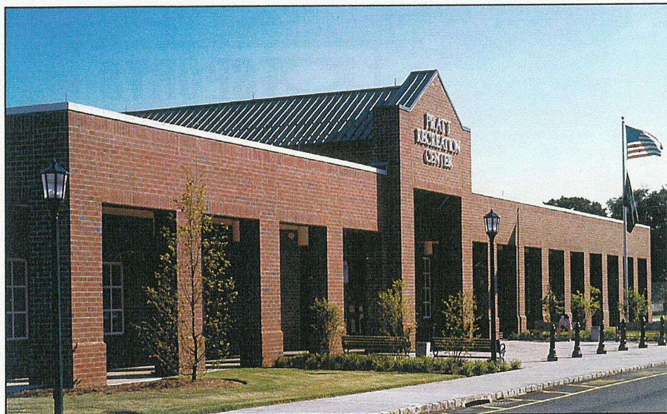
VISITORS TO THE SINGLE-LEVEL RECREATION CENTER FIRST ENCOUNTER A MODERN, RED-BRICK EXTERIOR WITH A COVERED, COLUMNED WALKWAY.

The lobby offers views into the cardiovascular fitness/weight room and natatorium on either side. Located left of the lobby, the fitness room houses a variety of cardio and strength-train-