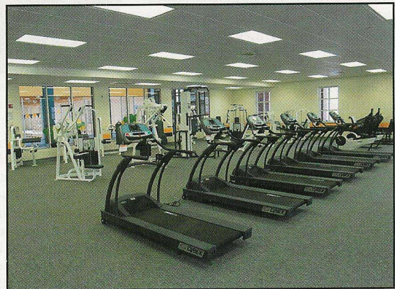
LOCATED LEFT OF THE LOBBY, THE FITNESS ROOM HOUSES A VARIETY OF CARDIO AND STRENGTH-TRAINING EQUIPMENT, A FREE-WEIGHT AREA AND A SMALL OFFICE.