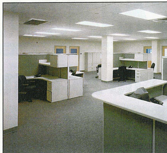
ABUTTING THE FITNESS ROOM ARE OFFICES FOR INTRAMURAL RECREATION DEPARTMENT STAFF.

ing equipment, a free-weight area and a small office. To the lobby's right is the natatorium, which features an eight-lane, 25-yard lap pool, a chair lift, an aquatic director's office, a pool storage room, and electrical and mechanical rooms. At the far end of the lobby is a large multipurpose room accommodating aerobics classes, a concessions area and two racquetball courts. Across the hall from these spaces is the gymnasium, which includes three full-size wood courts for basketball and volleyball, 3,500 bleacher seats, a batting cage and a stairwell leading to an elevated jogging track.