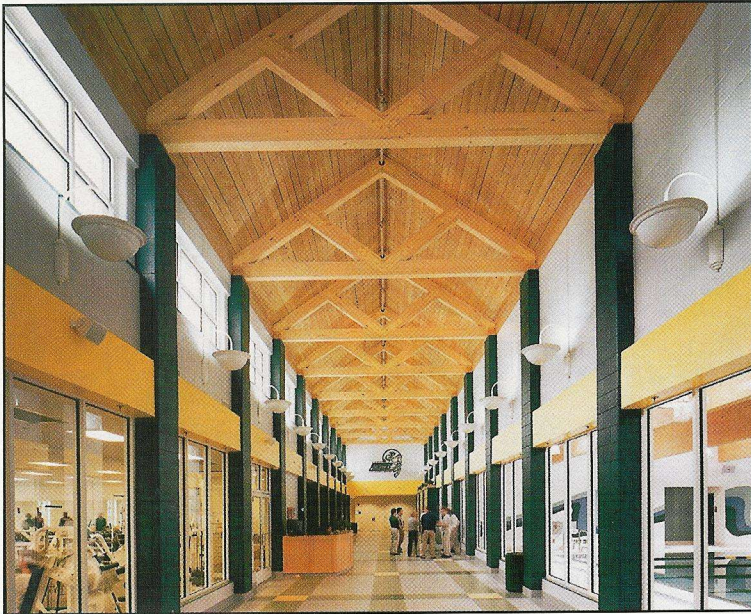
FEATURING A VAULTED WOOD CEILING, THE LOBBY IS AN IMPRESSIVE, AIRY SPACE AND IS FURTHER ENHANCED BY SOARING MASONRY COLUMNS AND CLERESTORY WINDOWS.

THE GYMNASIUM INCLUDES THREE FULL-SIZE WOOD COURTS FOR BASKETBALL AND VOLLEYBALL, 3,500 BLEACHER SEATS, A BATTING CAGE AND A STAIRWELL LEADING TO AN ELEVATED JOGGING TRACK.