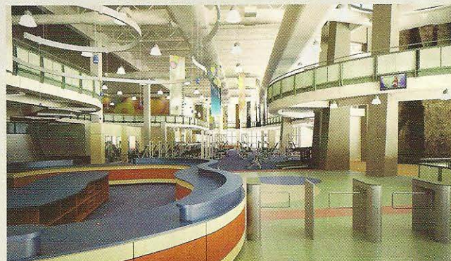
A lively interior color scheme reflects the culture of the region.

The new Wellness and Recreational Sports Complex is designed to be very open, with the lobby and control desk affording panoramic views of almost all major activity spaces. These include weight and fitness areas, a climbing wall, a track, racquetball courts and lounge space.