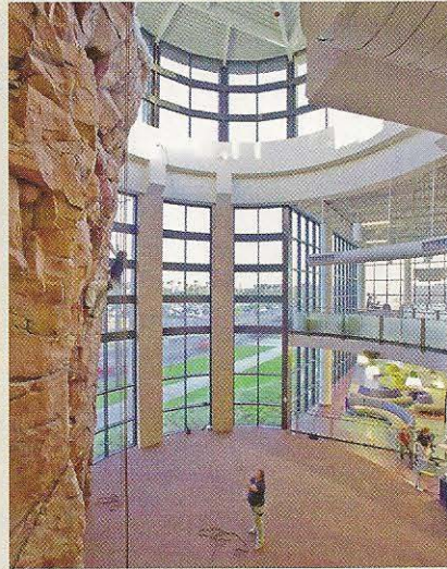
Consideration was given to natural light in all activity spaces.